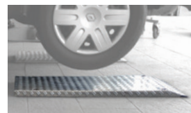
Tuning ramps for low or sports cars, set of 4 units