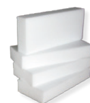
Polymer pads 50 x 150 x 340 mm (included)