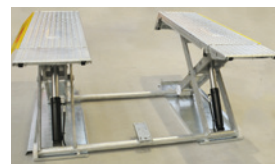
Fire galvanization of scissors and base plate for corrosive environment