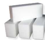
Polymer pads 100 x 150 x 340 mm