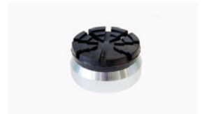
Height adapter 44 mm