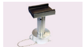
U-form adapter 150-233 mm