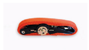
Lashing straps (2 units)