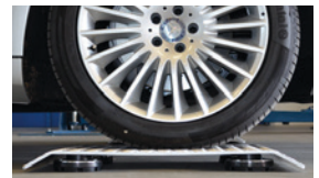
Drive-on tables (4 units)