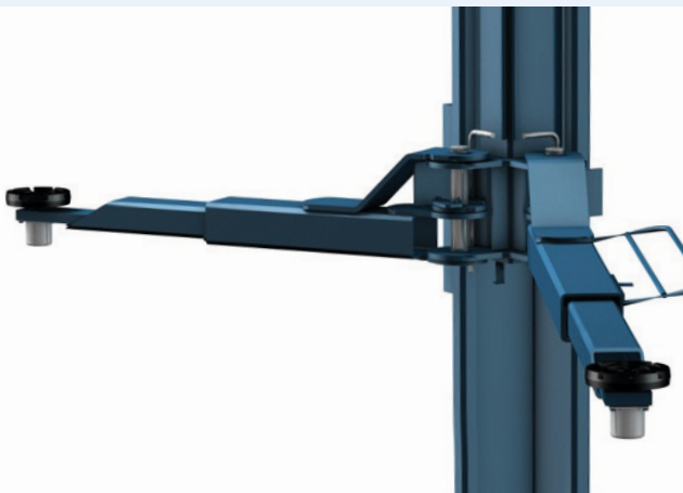
Scope of supply: telescopic asymmetric arms