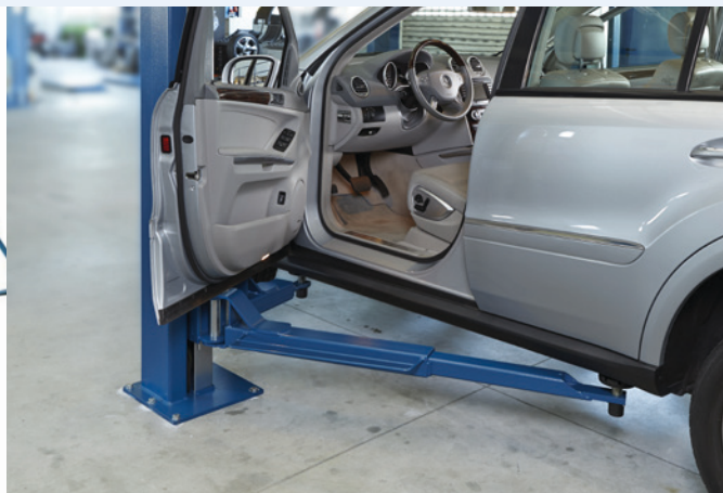
Optimal door clearance with asymmetric arms