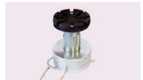
Height adapter 155-245 mm